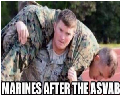
MARINES AFTER THE ASVAB